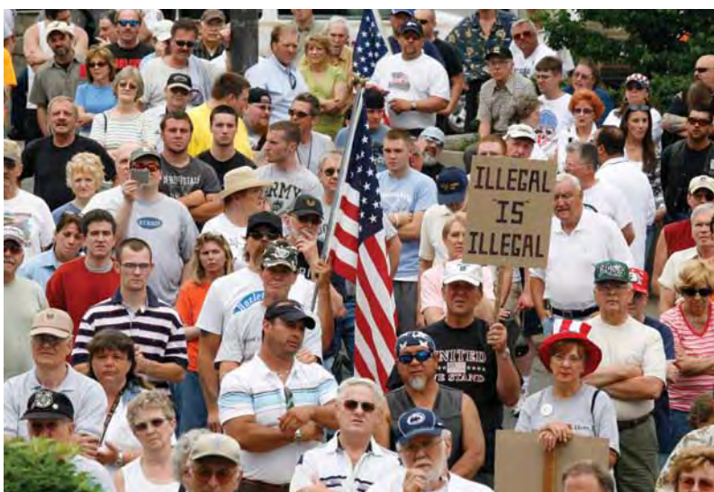
Supporters of Hazleton Mayor Lou Barletta and his anti-immigrant legislation gathered before City Hall in June 2007.

July 26, 2007 After 9-day bench trial, the judge strikes down both ordinances, writing, “Hazleton, in its zeal to control the presence of a