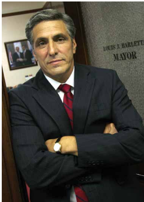
In 2006, Mayor Lou Barletta of Hazleton, Pa., wrote the first anti-immigrant ordinance to be adopted in recent years. His community paid a steep price, but Barletta went on to win a seat in Congress.