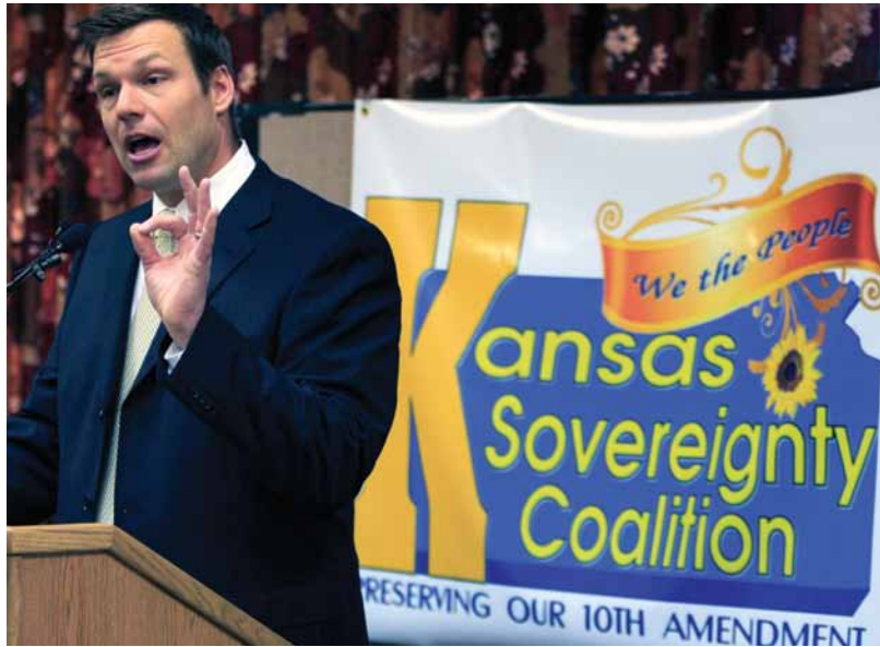
As a candidate for Kansas secretary of state last year, Kris Kobach associated himself with many conservative ideas. Here, he enthuses about the 10th Amendment, which delineates states’ rights.