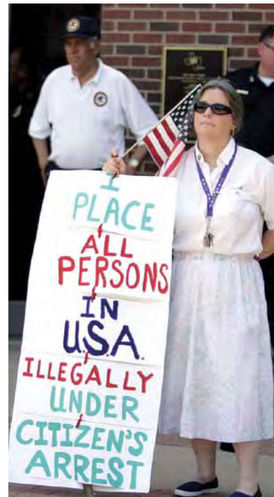
Protestor at Farmers Branch City Hall in August 2006

Nov. 13, 2006 The Farmers Branch City Council unanimously adopts an ordinance requiring renters to provide proof of citizenship or legal residency and fining landlords who rent to undocumented immigrants.