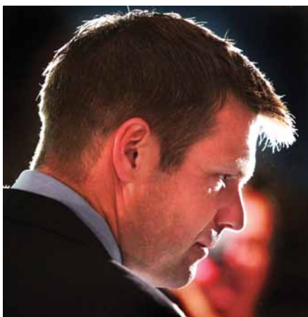
In town after town, lawyer Kris Kobach has helped to write and then defend harsh anti-immigrant laws. The cost to these communities, in terms of both dollars and race relations, has been immense.

Two years later, after a bruising campaign that finally led to the ordinance's approval in a special election last June, Fremont is struggling — and not only with the $750,000 in anticipated legal defense expenses that forced it to raise property taxes late last year. Like other towns around the country that have passed laws target-