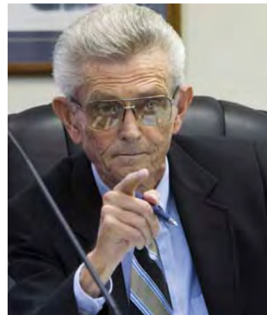
Fremont Mayor Donald “Skip” Edwards cast the tie-breaking “no” vote that killed a proposed anti-immigrant law. But the town’s voters forced a referendum and passed the law anyway.

June 21, 2010 Fremont’s voters approve the ordinance.